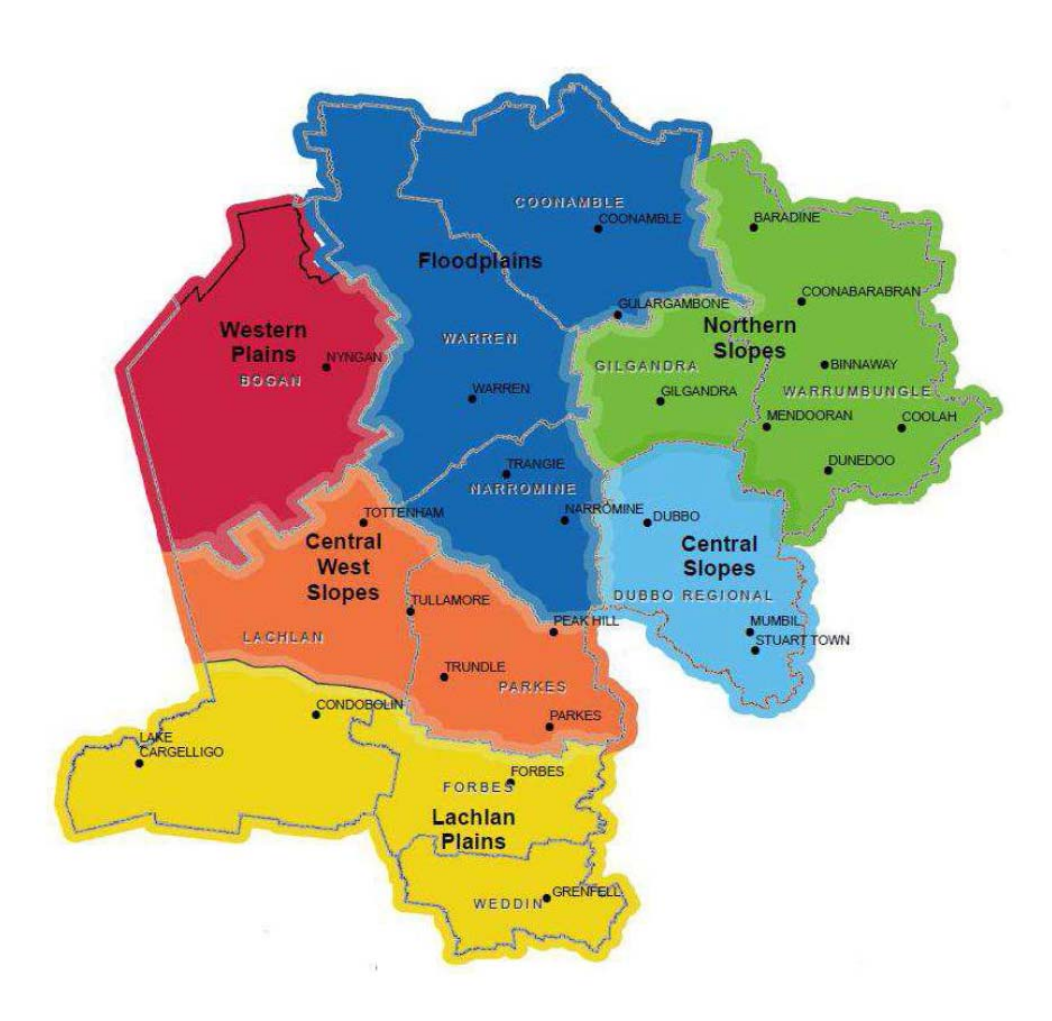
Figure 1: Central West LLS region showing regional landscapes

The Central West LLS region covers an area of 94,000 square kilometres in central western NSW. It comprises of twelve local government areas, including Weddin and Lachlan in the south, Warren and Coonamble in the north and Dubbo and Warrumbungle in the east. The region supports the major centres of Dubbo, Wellington, Parkes and Forbes, as well as many smaller towns ( Figure 1 ). The area falls predominantly within Wiradjuri Aboriginal Country.